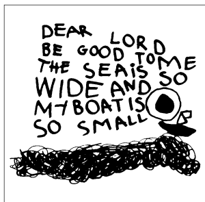
Children's Defense Fund

A joint release by Children's Defense Fund-Minnesota and the Minnesota Budget Project